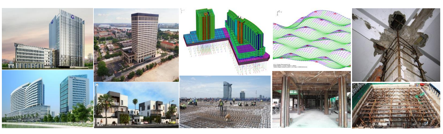
STRUCTURAL ENGINEERING DEPARTMENT

41, Corner Street 313 & 588 Sangkat Boeung Kok II Khan Toul Kork Phnom Penh, Cambodia